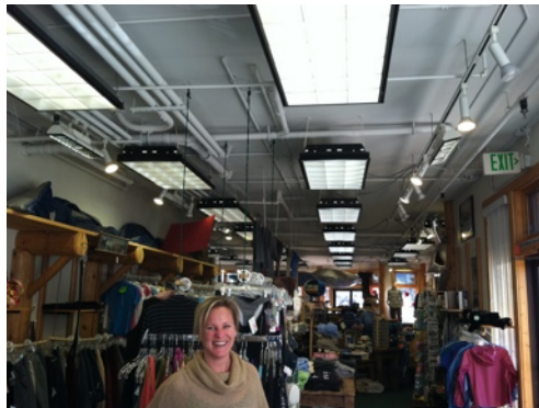
Rivers - Estimated Electricity kWh End-Use